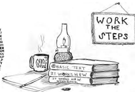
LIFE IN RECOVERY

NA A DAY CLEAN IS A DAY WON A GRATEFUL ADDICT WILL NOT USE 90 IN 90 JUST FOR TODAY KEEP COMING BACK DO THE WORK LET GO OF THE RESULTS IT WORKS IF YOU WORK SICK AS OUR SECRETS 12 STEPS 12 HAPPY AND FREE WE MUST TO WIN MORE WILL ATTITUDE A CLEAN MIRACLE NOTHING FREEDOM SELF ESTEEM ESTEEMABLE I CAN'T BUT NEVER ALONE FEELINGS SERVICE ACT AS IF LUN T I L CARRY THE MESSAGE LET GO & LET GOD EASY DOES IT BUT DO IT THE MASKS MUST GO KEEP IT SIMPLE JOYOUS INSIDE JOB THE BROADER THE BASE LIVE OURSELVES INTO A NEW WAY OF THINKING SPONSORSHIP IS THE HEARTBEAT OF THE PROGRAM BE REVEALED PRINCIPLES BEFORE PERSONALITIES OF GRATITUDE ADDICT IS A TURN IT OVER CHANGES IF CHANGES MEDITATE THROUGH ACTIONS WE CAN AMEND ARENT FACTS PRAY STAY 1953 NA NA DONT LEAVE FIVE MINUTES BEFORE THE MIRACLE HAPPENS H.O.W. HONESTY OPENMINDEDNESS AND WILLINGNESS PROGRESS NOT PERFECTION DIAL EM DONT FILE EM WE COME WE COME TO TO BELIEVE SPONSOR HELPING IS WITHOUT HOPE TRUST HAPPEN NEED DIE SOLUTION GET IN THE THE HIGHER THE POINT OF FREEDOM SURRENDER WE CAN A HOMEGROUP & TAKE HELP TO SANITY AND AMEND TO CHANGE CONTROLLED SELFISHNESS IN RECOVERY YOU MAKE IT DIE IN THE LIGHT