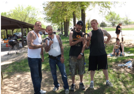
Permission given for newsletter article.

Overall the first campout of this region was a success! It was a great time had by all; even the kids. Plus the weather was absolutely perfect! Thank you HP for all the fellowship, great weather, good food, new friends in recovery, full hearts and souls, but most of all the opportunity to carry the message to the newcomers that attended their first campout and find peace and serenity in the woods.